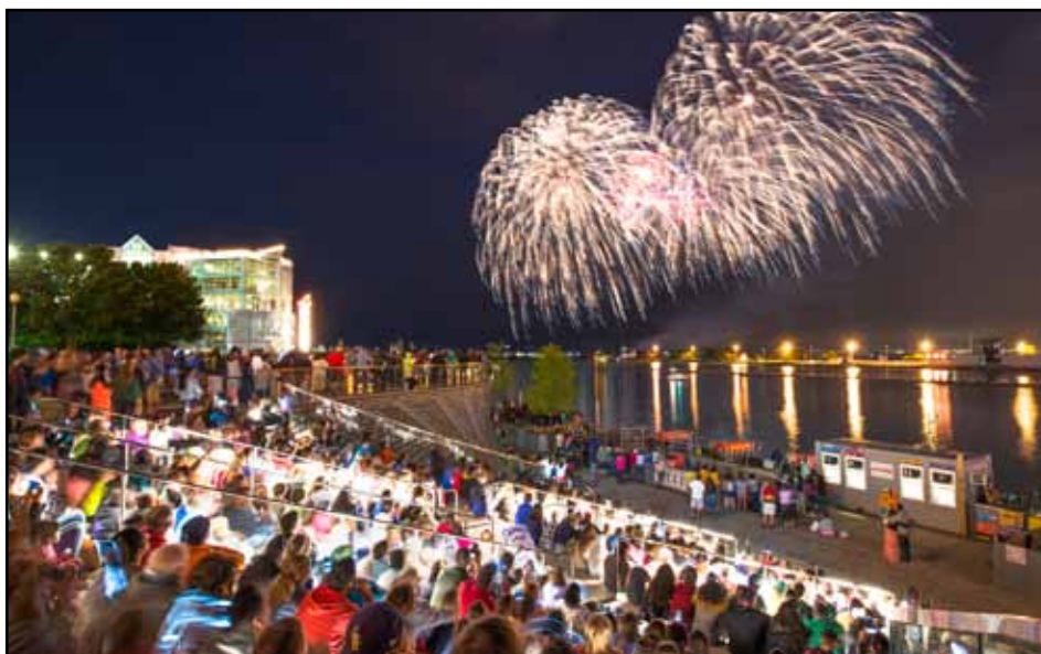
Navy Pier, el lugar favorito de Chicago para el Día de la Independencia, invita a los habitantes de Chicago e invitados a disfrutar de un extraordinario 4 de Julio, con música en vivo, Miller Lite Beer Garden y los Fuegos Pirotécnicos

del 4º de Julio de Miller Lite del Pier, el jueves, 4 de Julio. Como el único lugar frente al lago con el show de fuegos pirotécnicos de la ciudad, Navy Pier será el epicentro de las festividades del Día de la Independencia de la ciudad, con una extraordinaria demostración de 15 minutos de fuegos pirotécnicos sincronizados con música patriótica. Nuevo en el programa de este año, el Pier presenta orgullosamente el concierto "Tributo al Día de la Independencia del Grupo de Viento de la Banda Marina de los Grandes Lagos" el miércoles, 3 de julio a las 7:30 p.m. en Lake Stage