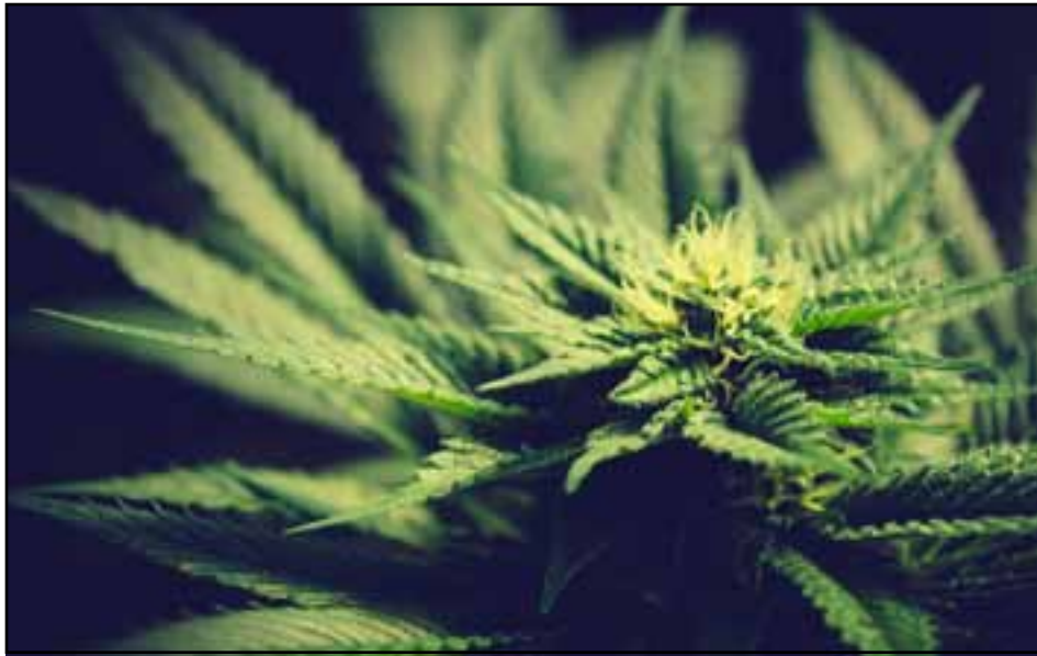
Rodeado por un grupo bipartidano de legisladores y abogados de reforma de justicia criminal, el Gobernador JB Pritzker firmó la mayoría de las leyes

centradas en la equidad el martes, para legalizar el uso de la marihuana en adultos en Illinois, a partir del 1° de enero del 2020. El Proyecto 1438 de la Cámara promueve la equidad e invierte en las comunidades que sufren por la guerra de las drogas, sirviendo como modelo para la legalización y la descriminalización de la marihuana.