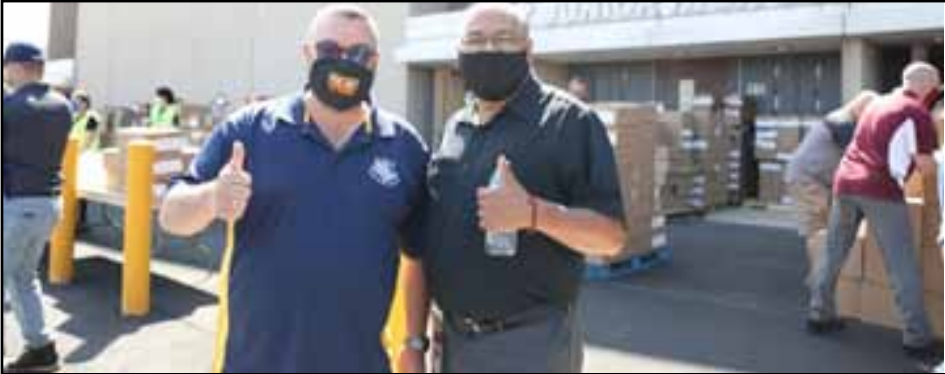
every Thursday through August at Unity Junior High School from 10a.m., to noon.