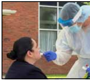
Unity Junior High School, 2115 S. 54 th Ave., Cicero at 10a.m. to 2p.m.

with the virus. Frontline workers, first responders, those who have been involved in demonstrations, protests, or other large gatherings and those who live in dense housing are particularly encouraged to be tested. Drive-up or walk-up testing will be available. The next testing will occur on Thursday, Aug. 20 th at