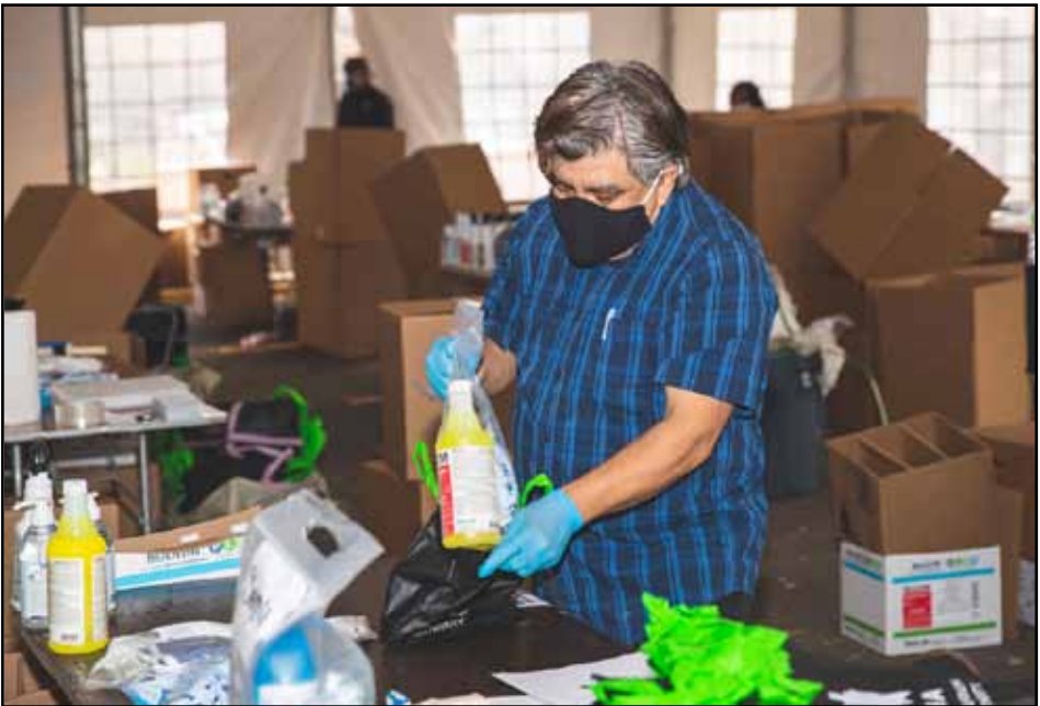
CHA employees assemble care packages for more than 19,000 CHA households.