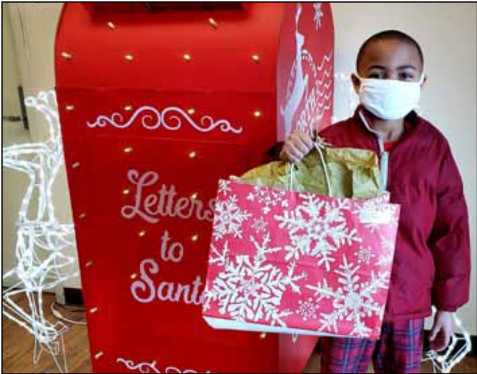
A child smiles after receiving his gift thanks to “Santa for a Day,” a website that grants children Christmas gifts.

Over the last several weeks, the Chicago Housing Authority helped to make a happier holiday season for thousands of its families, thanks to its sponsors and