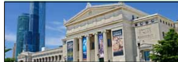
Rendering of the Wild Color yellow gallery

The amazing variety of color found in nature is not only appealing to see, but it also communicates a great deal of information to the surrounding world. The hues of plants and animals can warn predators, attract mates, or indicate their preferred diet while the brilliance and sparkle of color in gems and minerals can give clues to how they were formed. On October 22, a new exhibit at the Field Museum will transport visitors into an immersive, colorful world that organizers describe as a walk through the rainbow. Wild Color will highlight the science behind nature’s colors in this highly interactive exhibit featuring unique specimens from the museum’s collection. Wild Color will include a variety of photo-worthy moments and experiences for museum-goers of all ages. Throughout the 7,000-square foot exhibition, visitors will discover brilliant gems and iridescent minerals, explore the startling hues of animals that glow under ultraviolet light, and learn about a “super black” bird of paradise. The show will include vibrant visuals, large-scale media projections and soundscapes to create multisensory atmospheres, as well as examples of nature’s colors, like shimmering, radiant hummingbirds.