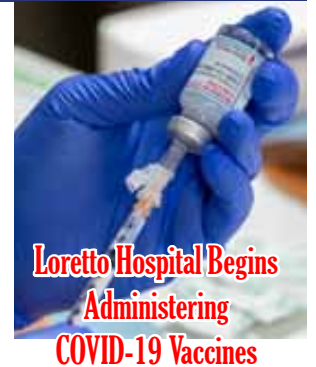
Loretto Hospital Begins Administering COVID-19 Vaccines

'Our goal is to Represent Children of Incarcerated Parents'