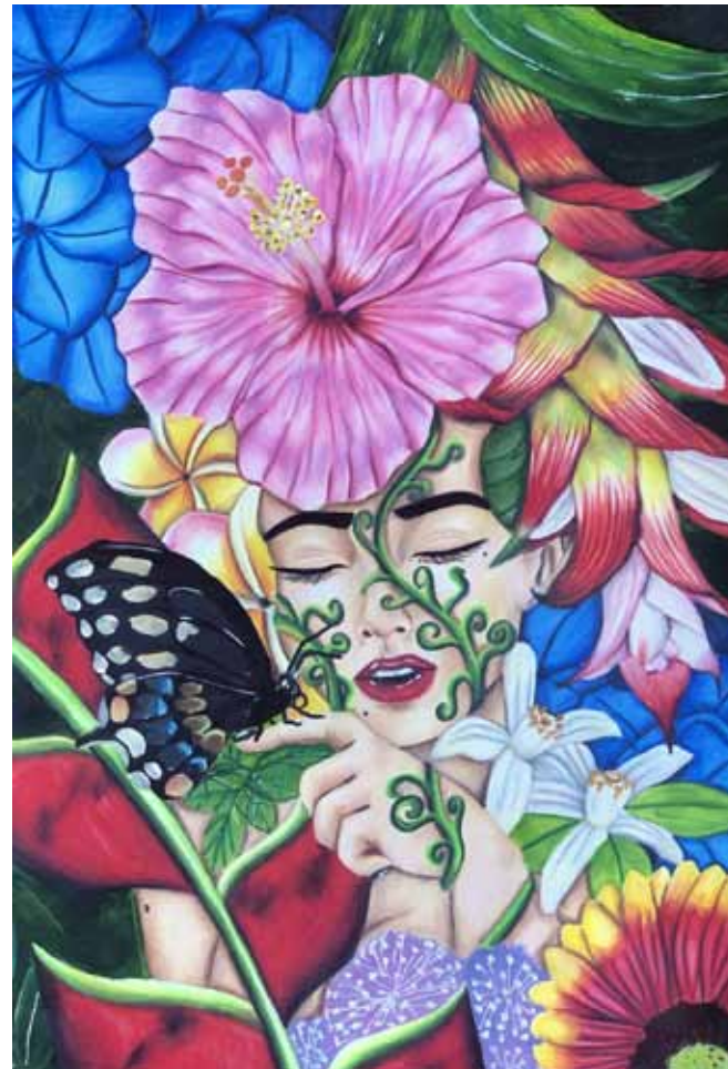
Artwork by: Surelly Marestein

Latino Art Beat anuncia al ganador de su beca de la competencia de arte y cine del 2021, disponible