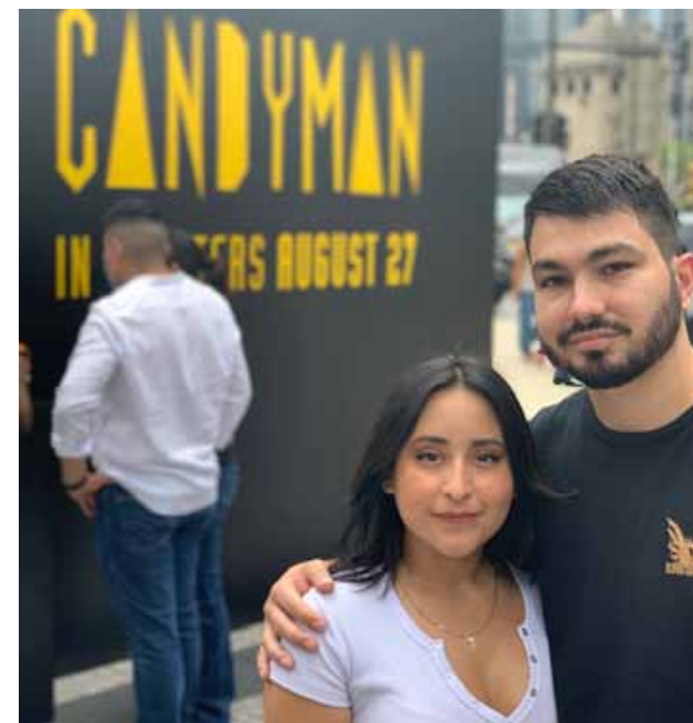
Caption por Ashmar Mandou

Gritos escalofriantes se dejaban oír a lo largo de Pioneer Court cuando el reto de Candyman "Say it. I Dare You" llegaba a Chicago para dejar dar a los