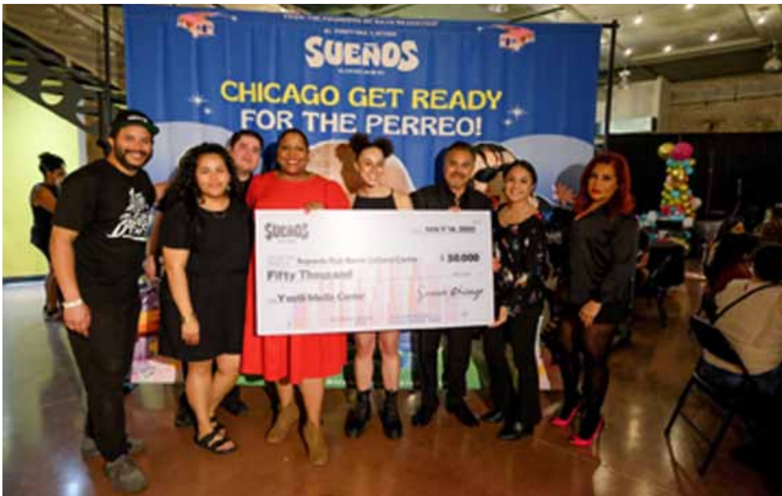
Sueños production team presents $50,000 check to support Segundo Ruiz Belvis Cultural Center's Youth Media Center.

Chicago's longest-standing Latino cultural center partnered with Sueños Music Festival to support a new Youth Media