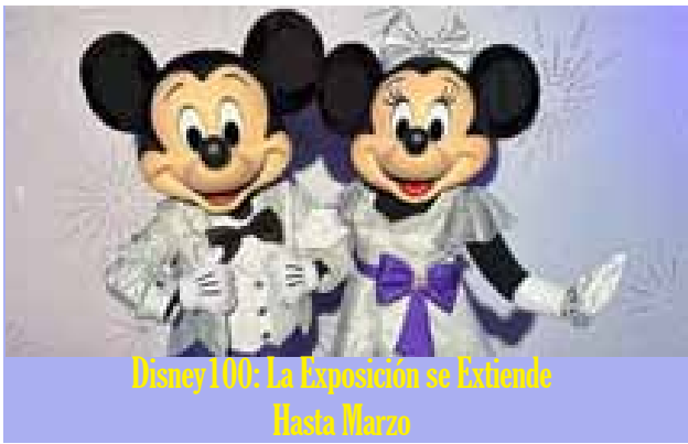
Disney 100: La Exposición se Extiende Hasta Marzo