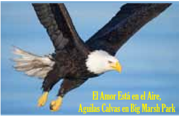
El Amor Está en el Aire, Aguilas Calvas en Big Marsh Park