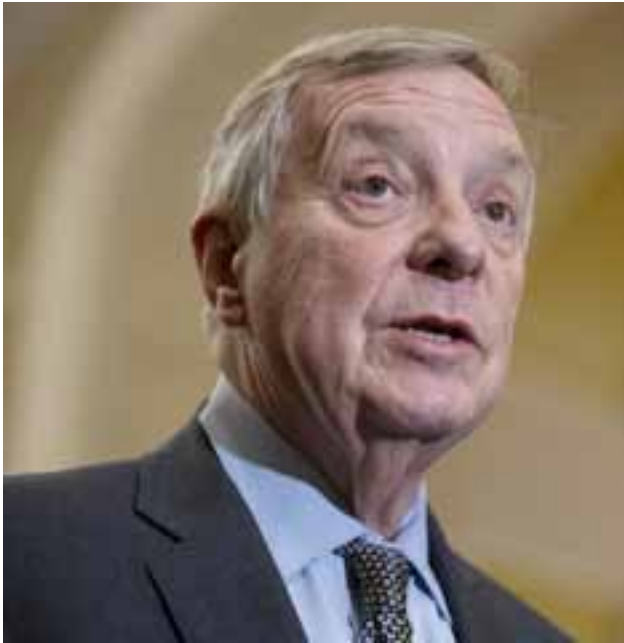
Caption by Ashmar Mandou

First elected to the Senate in 1996, Senator Dick Durbin, 80, announced he will not run for re-election in a video message on X Wednesday afternoon.