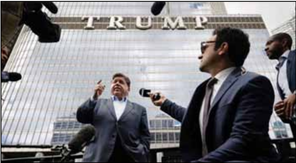
Gov. Pritzker talks to reporters on a Chicago River water taxi.

As anticipation continues to build in the arrival of the National Guard and ICE agents in Chicago, several elected officials are ready to fight. “None of this is about fighting crime or making Chicago safer. For Trump, it’s about testing his power and producing a political drama to cover up his corruption,” said Governor JB Pritzker. “We are ready to fight troop deployments in court and we will do everything possible to ensure that agents operating inside the confines of this state do so in a legal and ethical manner.” During a press conference on Tuesday, Governor Pritzker emphasized four key pieces of information; Trump is currently positioning armed federal agents on federal