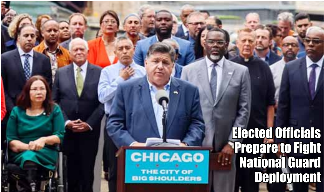
Elected Officials Prepare to Fight National Guard Deployment El Gobernador Pritzker junto con líderes del comercio, la educación, religiosos y comunitarios enfatizando que no existe una emergencia en Chicago para garantizar el despliegue de la Guardia Nacional, en una conferencia de prensa en el River Front.

Por Ashmar Mandou Mientras la expectativa continúa creciendo por la llegada de la Guardia Nacional y los agentes de ICE a Chicago, varios funcionarios electos están listos para luchar. “Nada de esto es para combatir la delincuencia ni de hacer que Chicago sea más seguro. Trump solo trata de poner a prueba su poder y crear un drama político para encubrir su corrupción” dijo el Gobernador JB Pritzker. “Estamos listos para combatir el despliegue de tropas en corte y haremos todo lo que sea posible para garantizar que los agentes que operan dentro de los confines de este estado lo hacen de una manera legal y ética”. Pase a la página 2