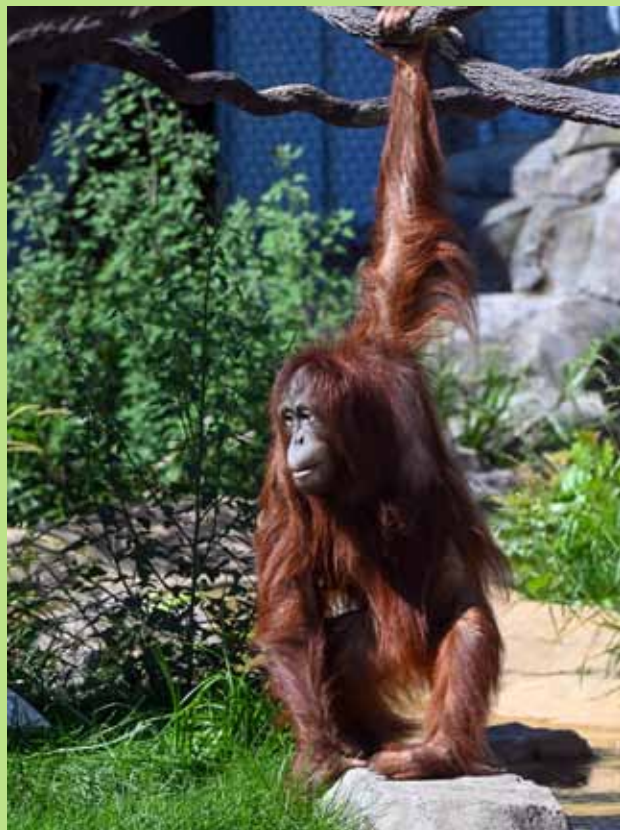
Chicagoans aren't the only ones loving the cooler temperatures. The Bornean orangutans at Brookfield Zoo Chicago are getting a taste of autumn adventures

in their new habitat at Bramsen Tropical Forests . Guests have recently been delighted as four of these critically endangered apes climb high up in the trees, show off their strength on bamboo-inspired poles and lounge low among greenery. Brookfield Zoo Chicago is a must-visit staycation destination. The Zoo is open from 9:30 a.m. to 6 p.m. through Monday (9/1), before adopting its fall hours. Guests can enjoy sweeping views of the Chicago skyline from the Ferris Wheel through September 7 th , feed a giraffe and take photos with nature's most colorful creatures at Butterflies! Make it a day at Brookfield Zoo Chicago, with more information available at brookfieldzoo.org/visit .